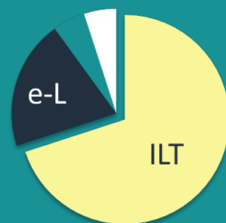
ILT represents 70% of training hours

System An all-in-one software which integrates multiple processes