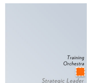
Training Orchestra position within the 9-Grid™ Zone

For more information see the Fosway 9-Grid™ Trajectory Guide on our website.